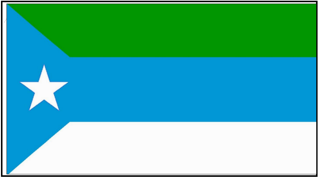
SCHEDULE TWO – THE STATE GOVERNMENT OF JUBALAND FLAG